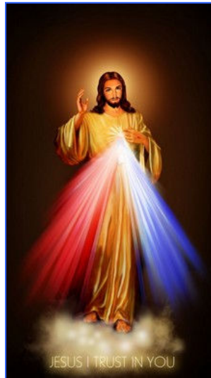
Jesus, I Trust In Your Mercy

Venerate this Divine Mercy Image daily. (View with honor and respect) Click to say the Apostles' Creed.