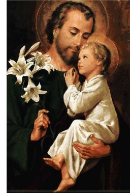
Prayer to St. Joseph over 1900 years old

O St. Joseph, whose protection is so great, so strong, so prompt before the Throne of God, I place in you all my interests and desires. O St. Joseph, do assist me by your powerful intercession and obtain for me from your Divine Son all spiritual blessings through Jesus Christ, Our Lord; so that, having engaged here below your Heavenly power, I may offer my thanksgiving and homage to the most loving of fathers. O St. Joseph, I never weary contemplating you and Jesus asleep in your arms. I dare not approach while He reposes near your heart. Press Him in my name and kiss His fine Head for me, and ask Him to return the Kiss when I draw my dying breath. St. Joseph, patron of departing souls, pray for us. Amen.